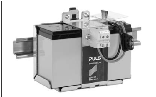
Fig. 26-1 UZK12.071